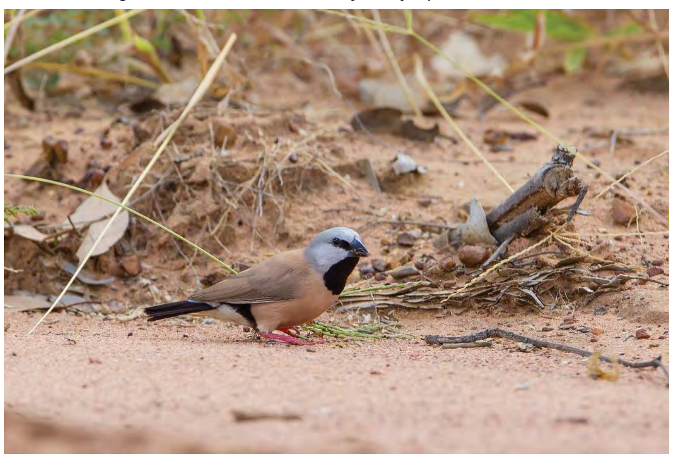
Figure 3-2 BTF Records within Poorly Surveyed parts of the Mine Site

Adult BTF ( above ) and young BTF ( below ) recorded as part of a flock of 9 BTF observed feeding along the edge of the Carmichael-Moray Downs Road within the central part of the mine site (EPC 1690; 17 April 2012). BTF were observed feeding on Digitaria ciliaris and Urochloa mosambicensis . The Adani mine camp is located within several hundred meters of this record location. The Applicant's survey results show few records for this part of the mine site, with the closet being about 4km to the north (incidental record; May 2012).