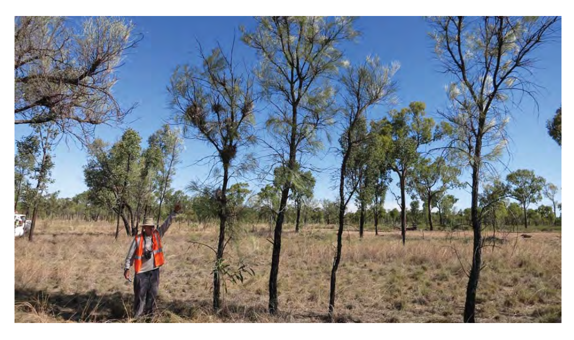
Figure 3-3 BTF Nests

Site of two BTF nests recorded November 2014 (above). BTF nest with covering of dead Acacia leaves (below). Located within western part of Stage 1 offset area and within 110m of a seasonal watercourse (55K 427246 7565172).