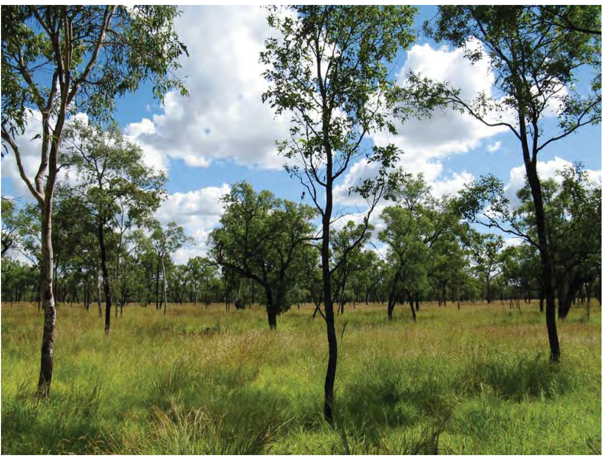
LRA_BTF_Statement of Evidence.docx

Grassy woodland habitat adjacent to the north (above) and south (below) of the BTF record location. There is a large part of the site to the north which supports suitable habitat for BTF, though subject to a very low level of survey effort (cf. the concentration of repeat survey effort within the northern part of the site). Permanent water is known within approximately 1km from this BTF record site.