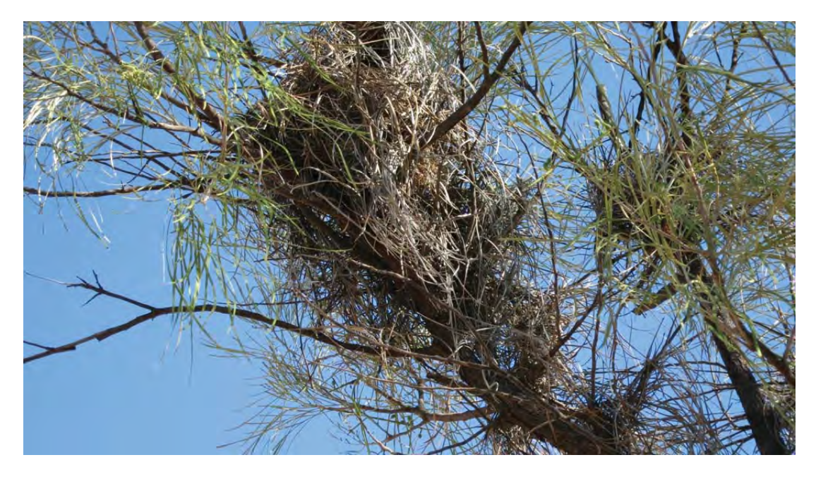
Typical nest structure (below) recorded at a monitoring site in Townsville (March 2013).

Site of two BTF nests recorded November 2014 (above). BTF nest with covering of dead Acacia leaves (below). Located within western part of Stage 1 offset area and within 110m of a seasonal watercourse (55K 427246 7565172).