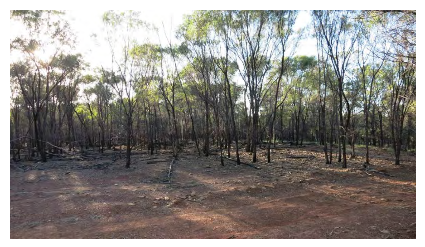
LRA_BTF_Statement of Evidence.docx

Below - This habitat is within 350m of an Ecological Equivalence survey site which is mapped as "high value" habitat for BTF (view east; 55K 426231 7560741). Photographed habitat mapped by ELA (2014b) as "low value" habitat for BTF, which is correctly mapped according to the high/medium/low comparative habitat values hierarchy provided in ELA (2014b). Evidence in the field suggests that the actual ground extent of this "low value" habitat is more widespread than depicted in the ELA (2014b) BTF habitat values mapping for offset areas to the north and south of the Carmichael River.