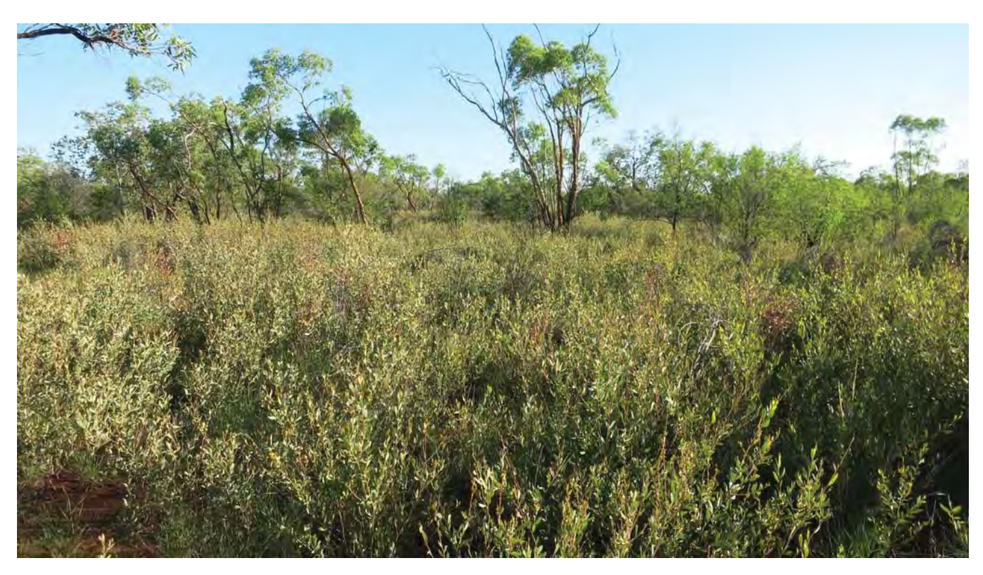
Figure 3-4 Variation in Habitat Suitability and Inconsistencies between Ground-truthed and Modeled Habitats

Above - Habitat dominated by low and dense acacia and woody regrowth. This habitat is within 400m of a Ecological Equivalence survey site which is mapped as "high value" habitat for BTF. Photographed habitat mapped by ELA (2014b) as "medium value" habitat for BTF, though obviously not suitable foraging habitat (view east; 55K 426242 7560924).