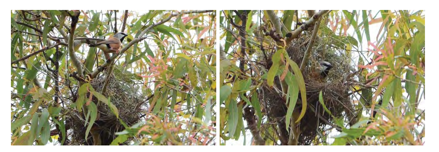
LRA_BTF_Statement of Evidence.docx