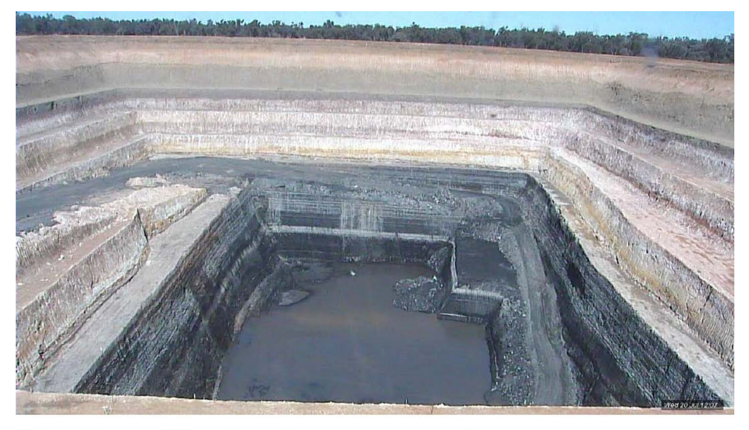
Plate 2: Wednesday 20 July - Perimeter bore pumps switched off

Plate 1: Wednesday 13 July – Sump pump switched off, perimeter bore pumps remain operational