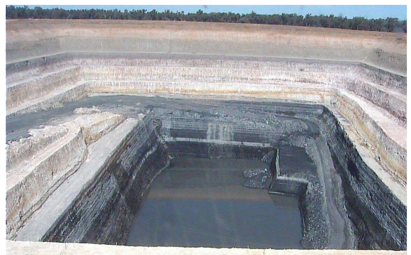
Plate 3: Wednesday 27 July - 1 week after perimeter bore pumps switched off